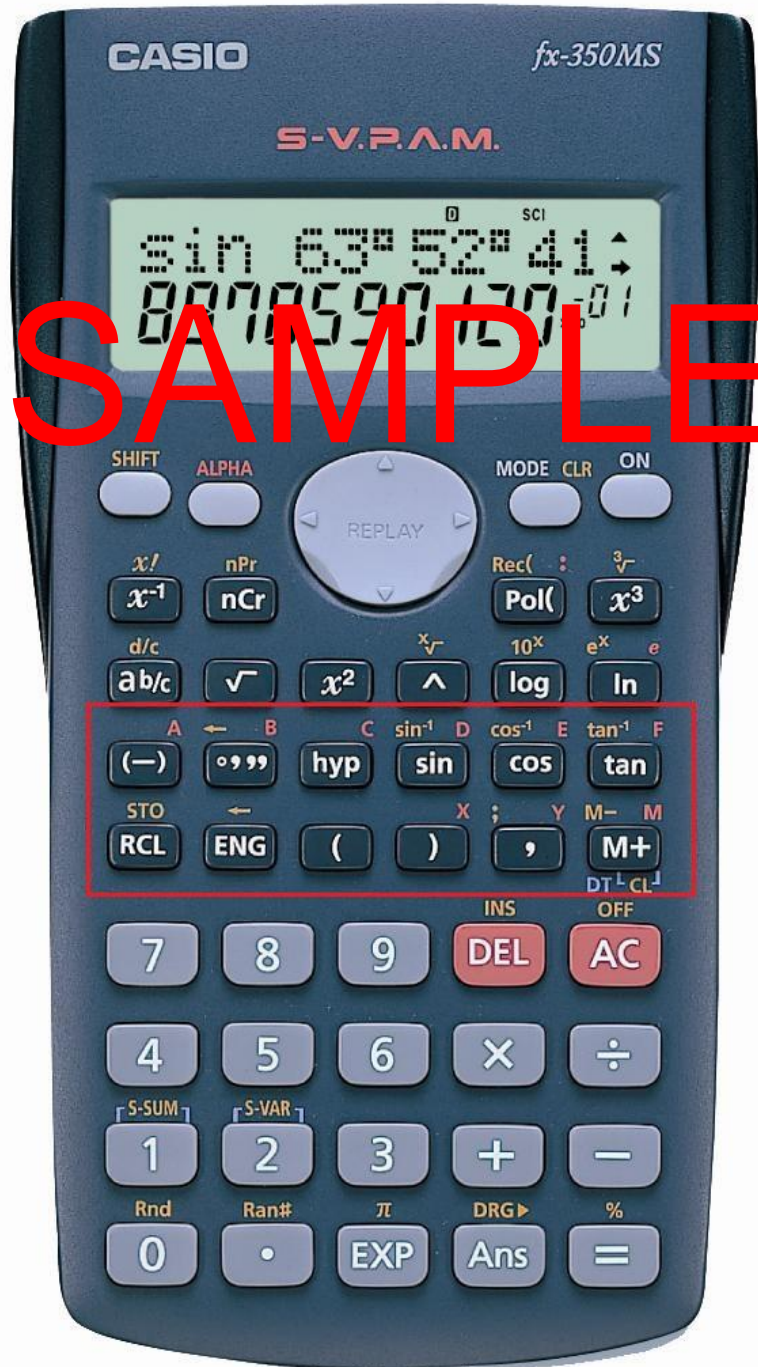
Casio fx-350MS Non-Programmable Scientific Calculator

Some non-programmable scientific calculators may have a limited number of alphanumeric keys (e.g., A to F ; X , Y , M ). They do not feature keys with the full alphabet ( A - Z ). See the example below of an acceptable non-programmable, non-QWERTY scientific calculator: